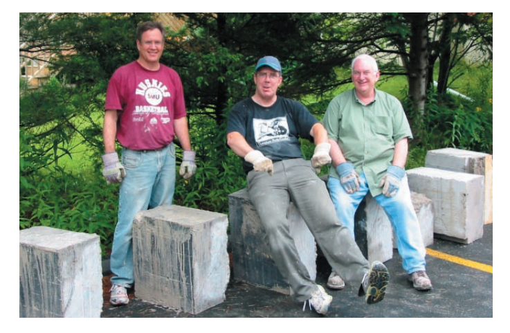
(Above) One works, three observe... (Left) The demolition crew in the old TAG lobby

GET YOUR NEWSLETTER IN COLOUR! Members, you can receive your newsletter in COLOUR, electronically -- and it will save TAG the printing and postage costs. Just send the request along with your email address to: info@tagtheatre.com