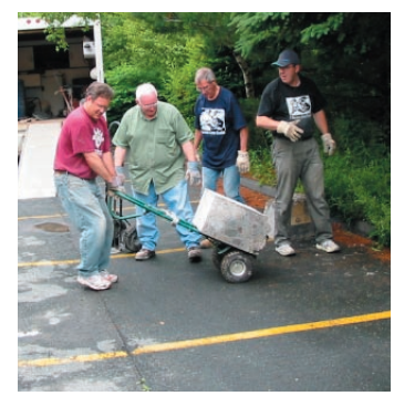
(Above Left) Dust control during the old lobby demolition (Above right) Real concrete weighs more than Styrofoam!